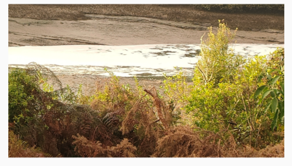
Pollution in Pakuranga Creek August 2023.

These events underline the importance of local people reporting adverse events in local streams so the source can be identified, and education (and preventative intervention) provided.