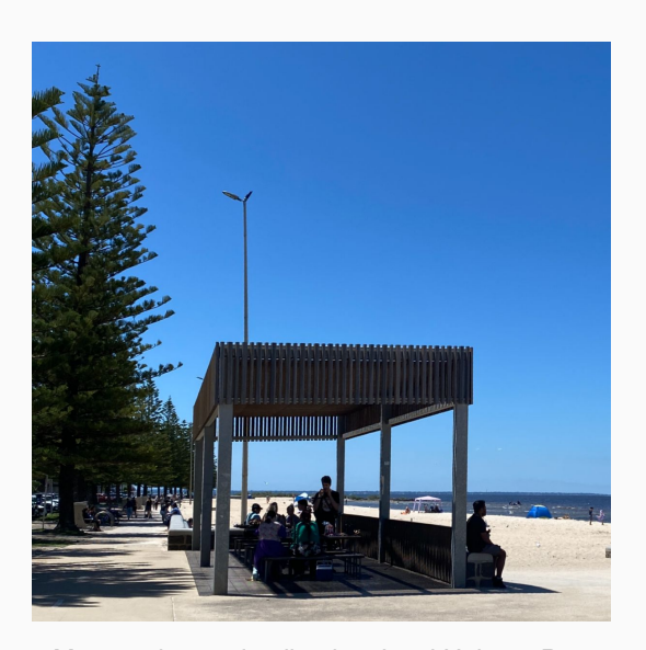
More and more feedback to local Hobson Bay council request shaded areas. Therefore council are planing more hard structure shading like this one by the pier in neighbouring Altona.