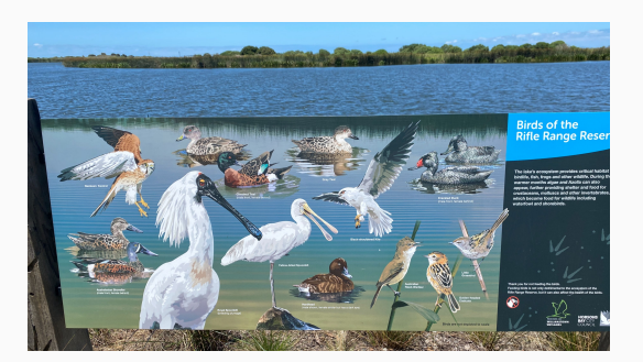
There are plentiful of beautiful signs telling people about the local fauna.