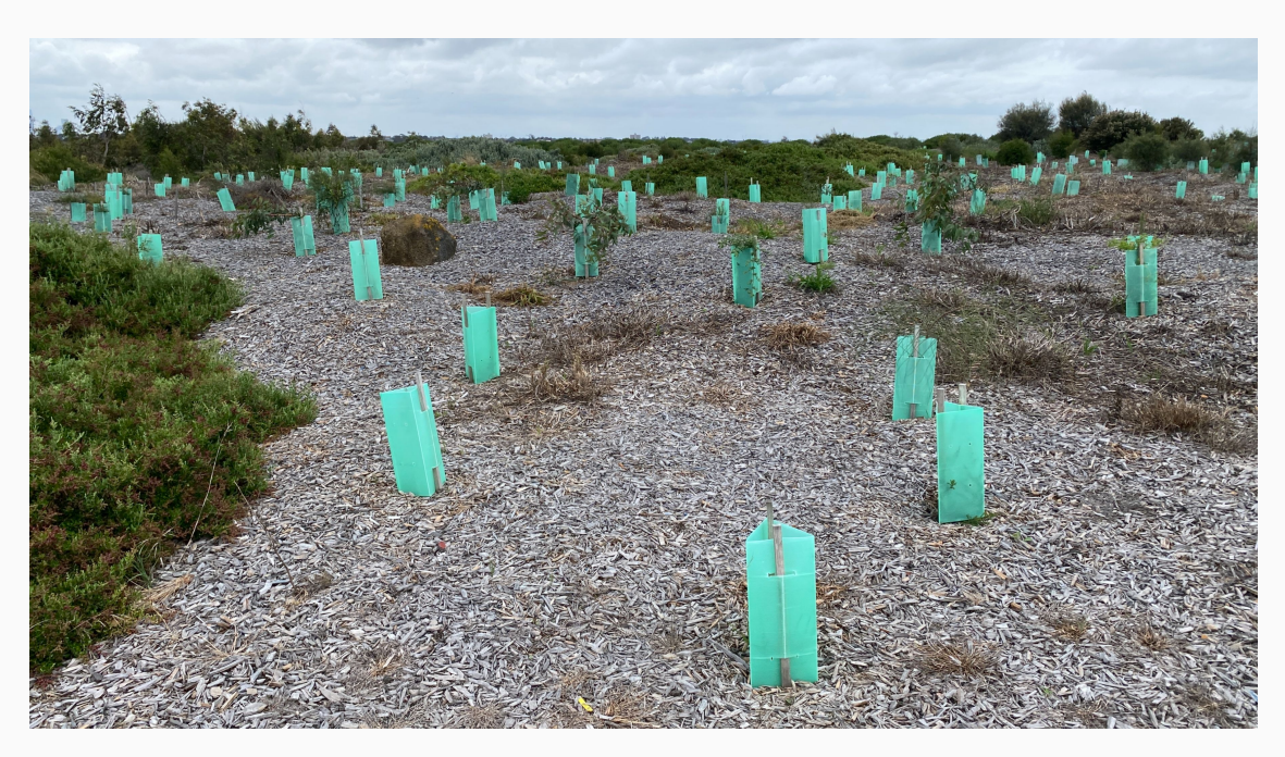
Hobsons Bay Council have done lots of revegetation in and around the wetlands area along the coastline to Port Phillip.