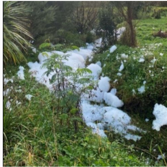
In July Omaru Creek was smothered in heavy detergent foam, that flowed out into the Estuary.