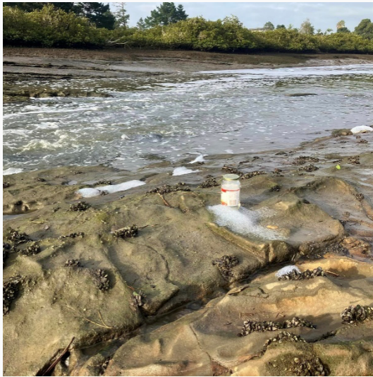
A foam pollution event in Pakuranga Creek (May)

Auckland Council Pollution Hotline on 09 377 3107 (24 hours a day, 7 days) Report pollution (aucklandcouncil.govt.nz)