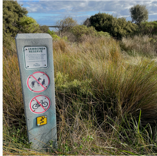
Signage we don't see in New Zealand!