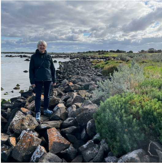
View of part of the large wetlands area in Williamstown in the south west of Melbourne.