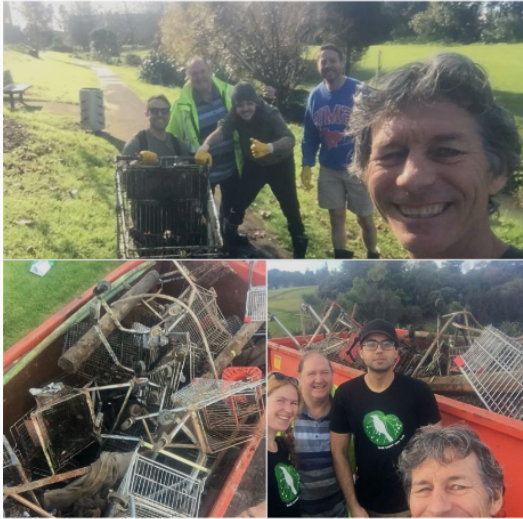
The team at work cleaning up at Cascades Stream. Well done.