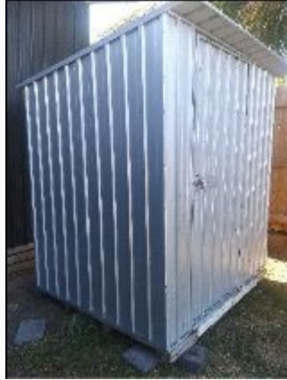
TEPS tool shed kindly donated.

Thanks to our TEPS subcommittee we also have a suite of documents to help plan and safely deliver clean-up projects, in development. We look forward to creating helpful resources to support local clean-up events.