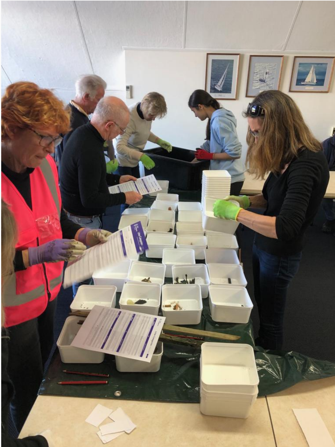
Categorising, counting and weighing the litter at Bucklands Beach Yacht Club.