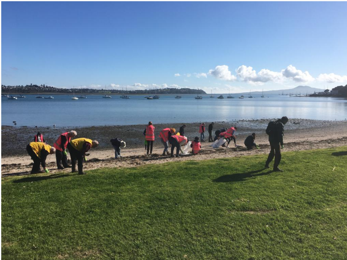
Little Bucklands Beach Litter Intelligence Survey volunteers, 24 July 2021.