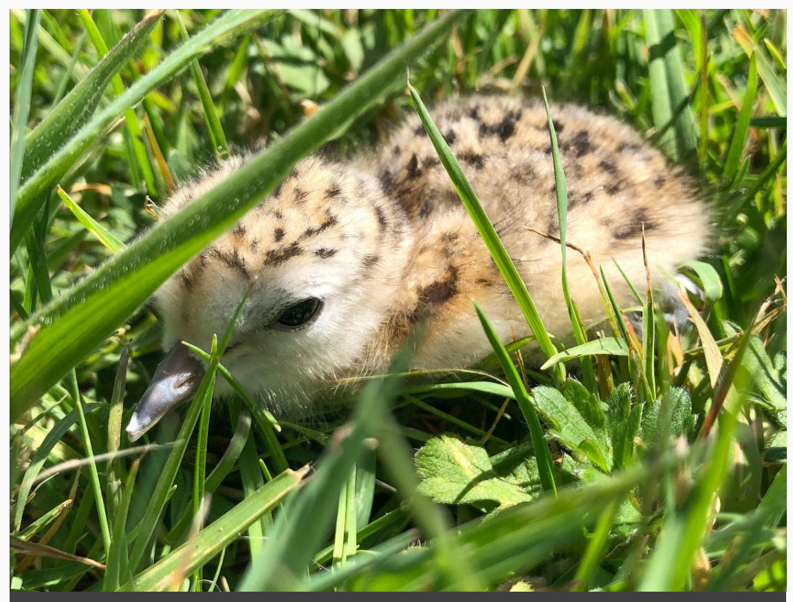
One of three gorgeous chicks hatched at Point England Reserve this season.

NZ Dotterel have hatched chicks on both sides of the Tāmaki Estuary for the first time in recent memory. Two chicks at Saint Kentigern's sports fields and three chicks at Point England Bird Sanctuary.